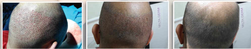
• Day of implants